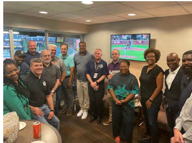
Photos top to bottom: MSA at the Maryland Minority Business Counts: Elevate & Engage event at Coppin State University; MSA at the Maryland Association of Counties Summer Conference, MSA hosting MBE nextworking nights in our suite at the ballpark.