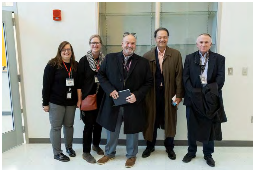
Photos from top to bottom: Exterior of newest 21st Century School Building at ribbon-cutting; MSA leadership and Cross Country Middle / Elementary School project team